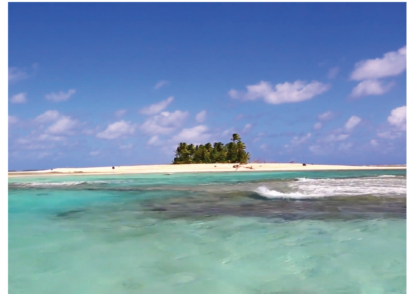
Peggy Ahwesh, The Blackest Sea , 2016