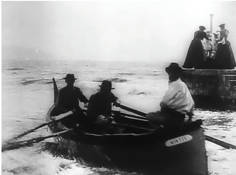
Louis Lumière, A Boat Leaving the Harbour , 1895