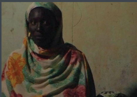
Mati Diop Atlantiques 2009

16 min., digital video colour and sound, exempt